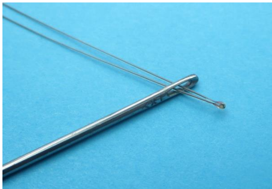
Figure 1 The physical photo of ATH10K1R0